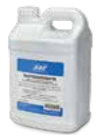
Oil PN 6102 2.5 Gallon Jug Specially-Formulated for Extended Protection

Contact Cat Pumps for more information at info@catpumps.com or (763) 780-5440