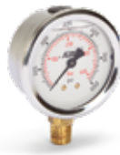
Pressure Gauge PN 6089 0–6000 psi