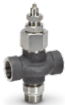
Relief Valve PN 890709 20–60 gpm 1500–4000 psi